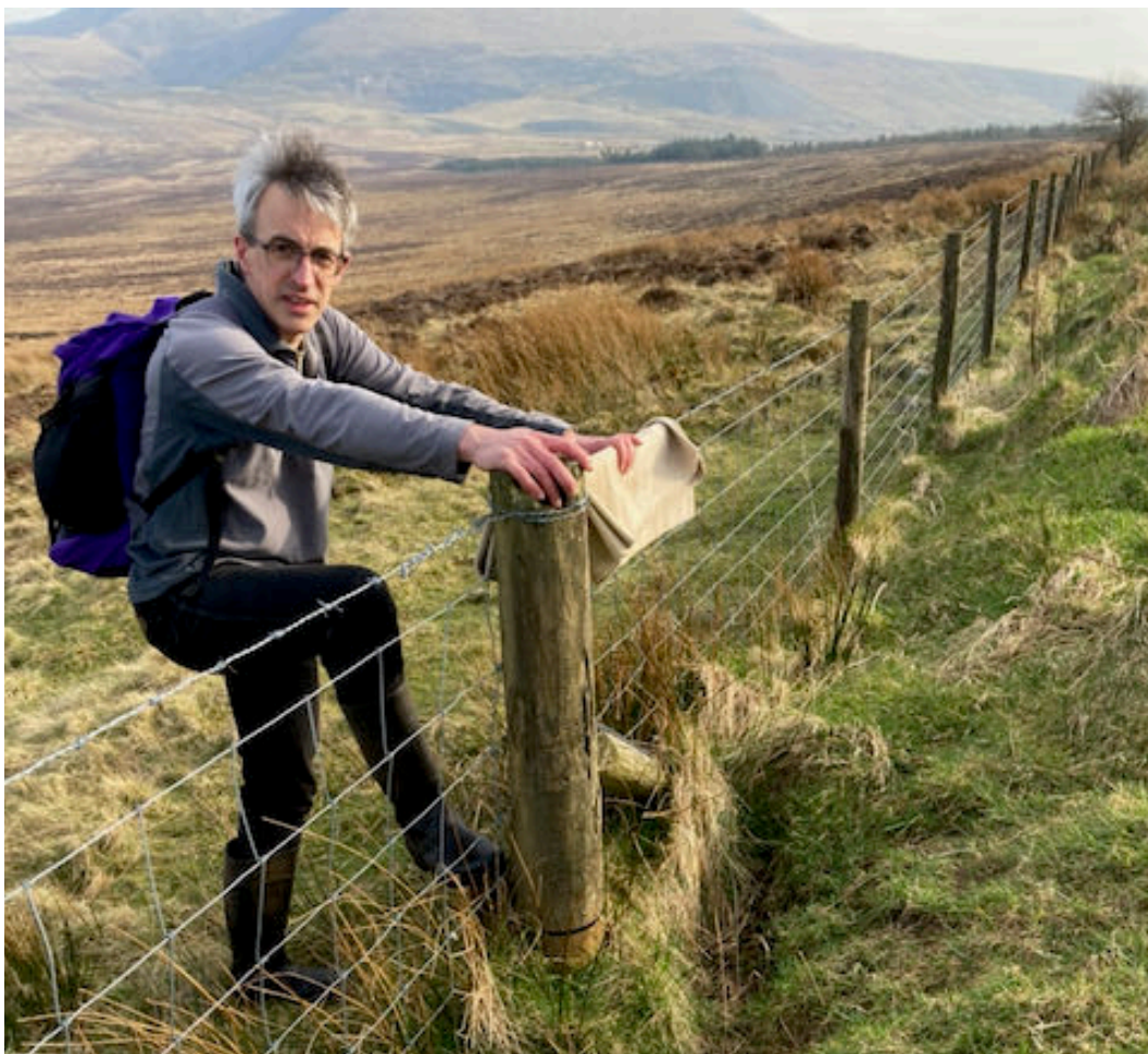
Going over the fence at the outdoor site.

Monday 12th May: I appreciate that some people will have to leave to work on Monday. I'm not working on Monday, so plan to go flying outside in Mynydd Llandegai again. There are no competitions planned for Monday.