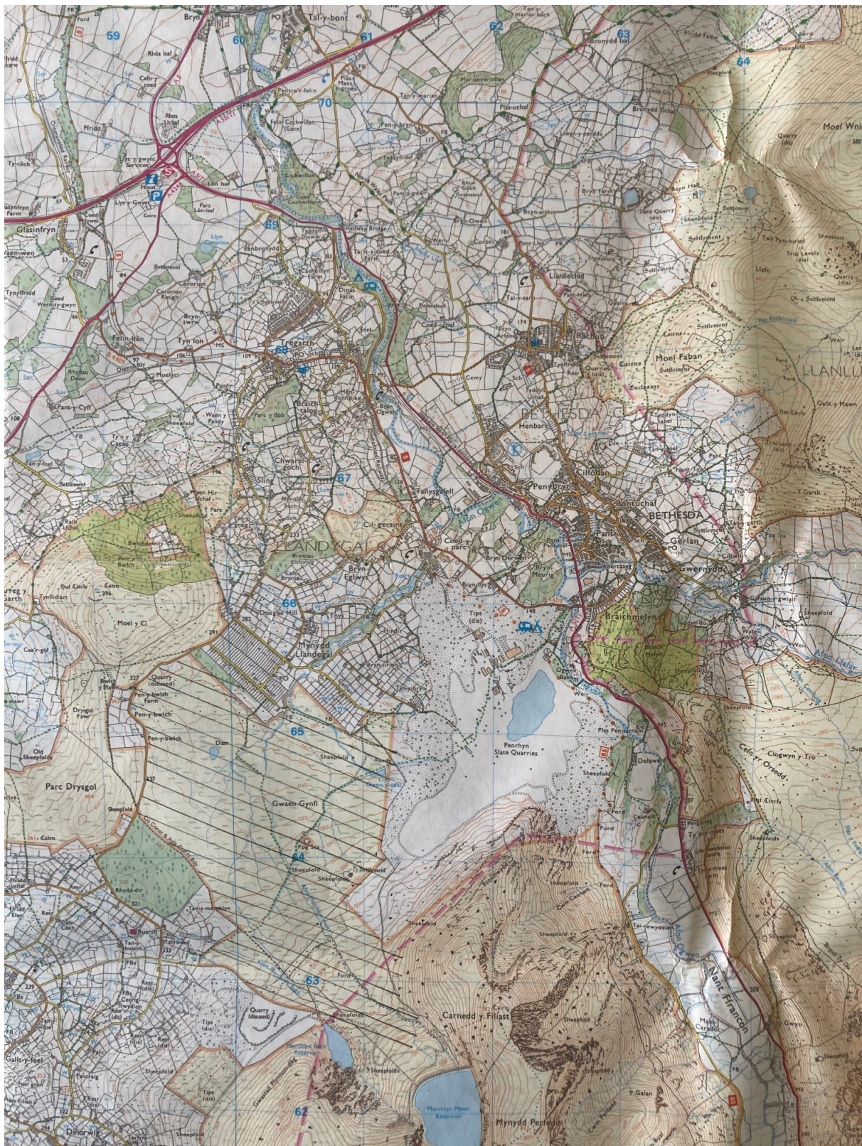
A wider view of the outdoor site location. The A55 is to the north, access via Bethesda A5 and minor roads.