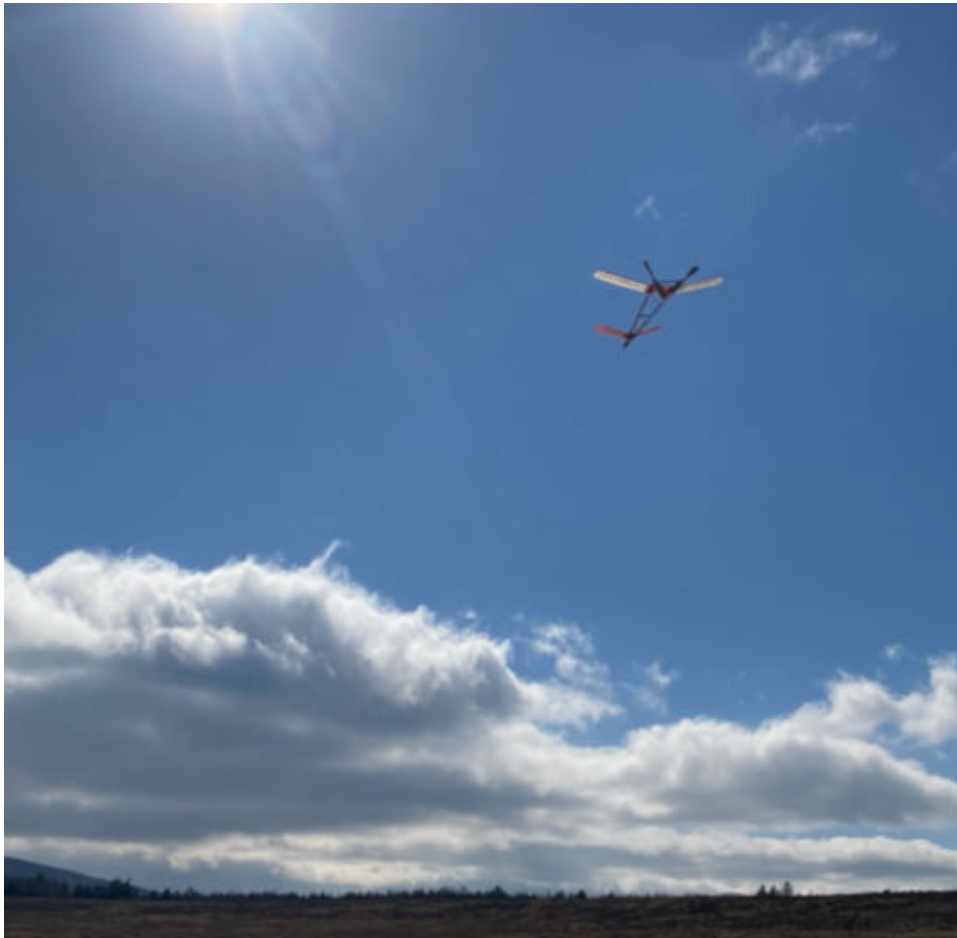
A-Frame Pusher over the outdoor site.

This really helps my planning - booking restaurants etc.